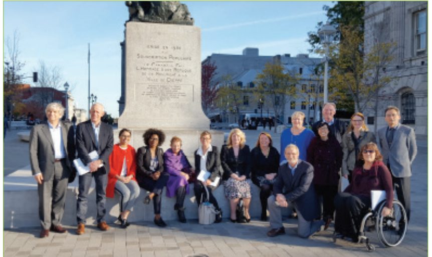
Disability leaders visiting Place Vauquelin in Montreal.

The IIDL group then travelled to Montreal to McGill University for discussions on social inclusion and engagement. This included conversations about universal design culminating in a tour of Place Vauquelin. This is an accessible park that the city of Montreal is very proud of, showcasing a great example of universal design.